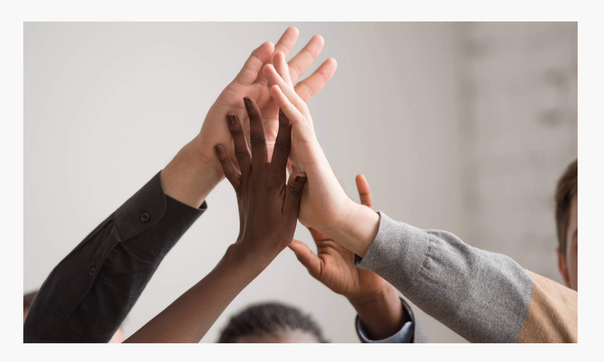
Table of Ten $1,500 +gst

Still contribute to this incredible cause by reserving a table of ten for you and your guests. Includes food, beverages, entertainment and a chance to bid at auction.